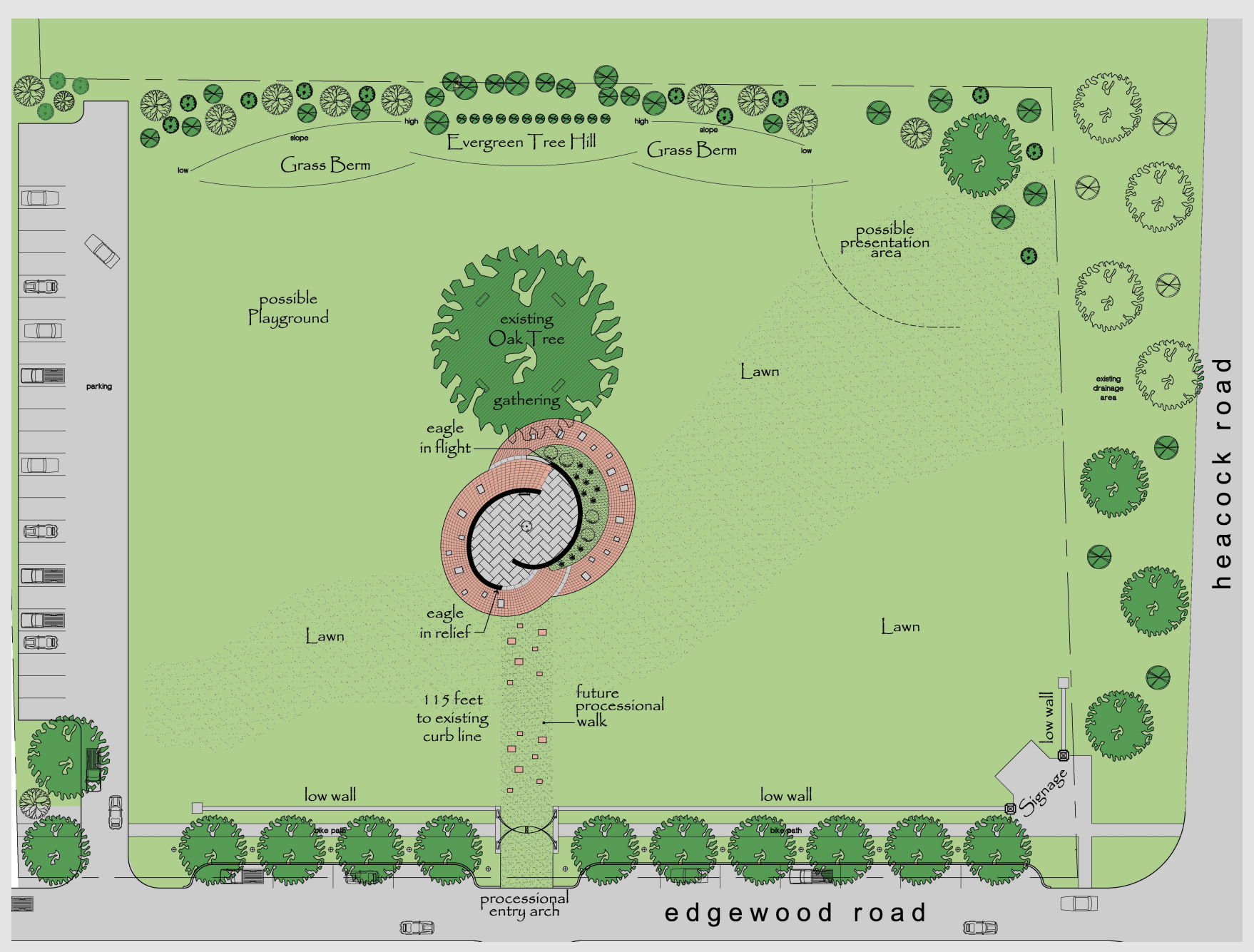
Park Master Plan