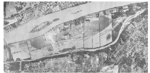
1955 Flood Map of the Delaware River (south of Yardley Borough)

Call or stop in at the Township offices if you need assistance with understanding this information. If your insurance policy has identified your home as a repetitive loss property, we can assist you with assessing options to mitigate potential flood damage. Call 267-274-1123 if you want to discuss your options with our Professional Engineers or Certified Floodplain Managers.